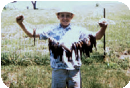
The author is holding a fine string of big bluegill about 1963 and wearing a hat he would rather forget now.

Bluegill provide an excellent day's fishing with promise of a good fillet dinner. These