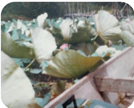
This is in the middle of the lily pads. Below, one can see the green UMCO tackle box.

From past experiences I knew that bass were there, invisible, but they were always below the dense lily pads. It was a little bit difficult for me to keep a sense of high anticipation in