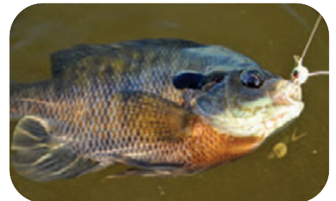
Bluegill are top fighters on flyrods or ultralight. A school of big "gills" will provide a day of action and an incredible meal!