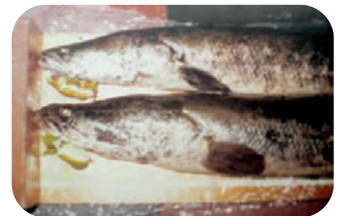
The above fish are called "Rai-Gyo". A large one is more than 1 meter in length.

Bill Plummer's Super Frog was a lure of impulse in my angling history.