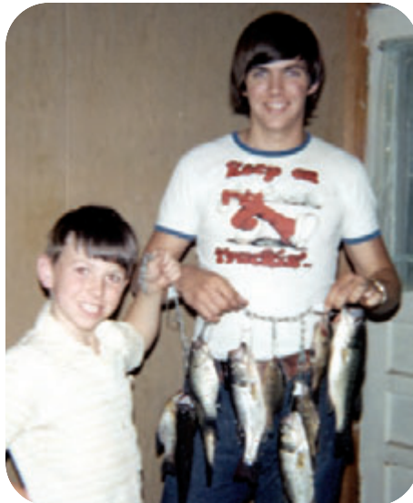
The author and his little brother hold a string of bluegill and other species that made a fine dinner. By 1970 the author had given up strange fishing hats for long hair. Today he is bald and wearing ball caps.

During the spawn bluegill are mostly caught in shallow areas. After spawn, bluegill are found in deeper areas. But they will move into the shallows for food, especially around logs and stumps. Fly fishermen consider this